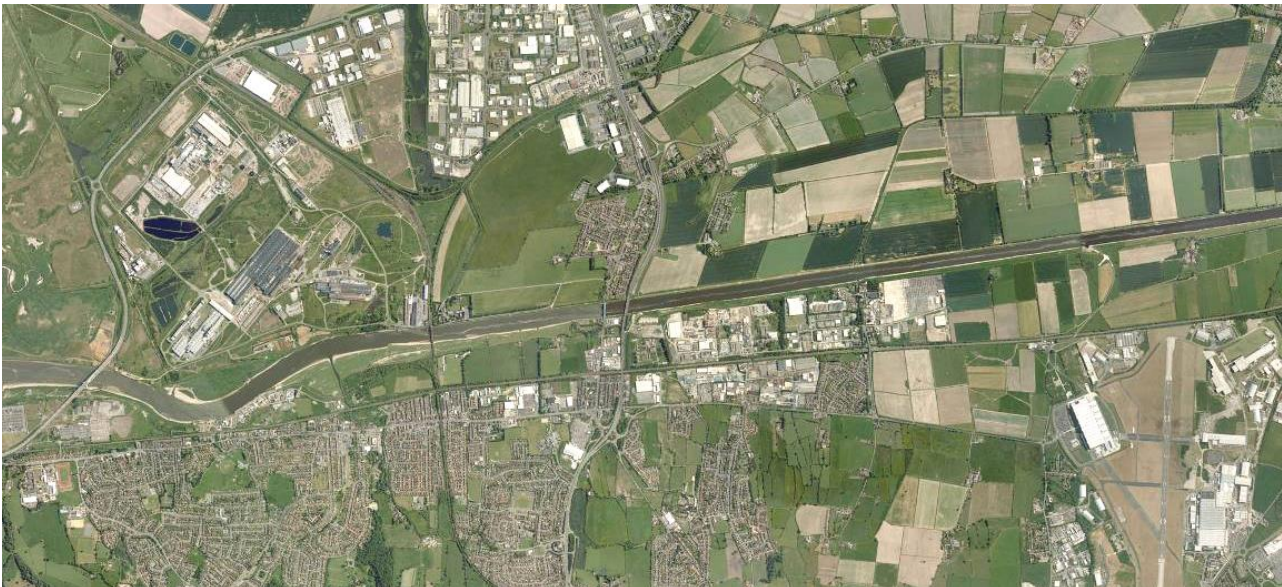
The canalised, straightened, tidal River Dee near Queensferry. Large geometric fields cover the reclaimed land, with road, rail and industrial developments.

The area is by no means entirely built-up or busy. Much of the area is actually a mature, lowland countryside and, in places, there is a sense of smallness and seclusion offered by agricultural enclosure and its interplay with trees, copses, woodlands and small river valleys. Across the estuary, the Wirral impacts perceptibly upon the skyline, as does greater Merseyside from higher elevations.