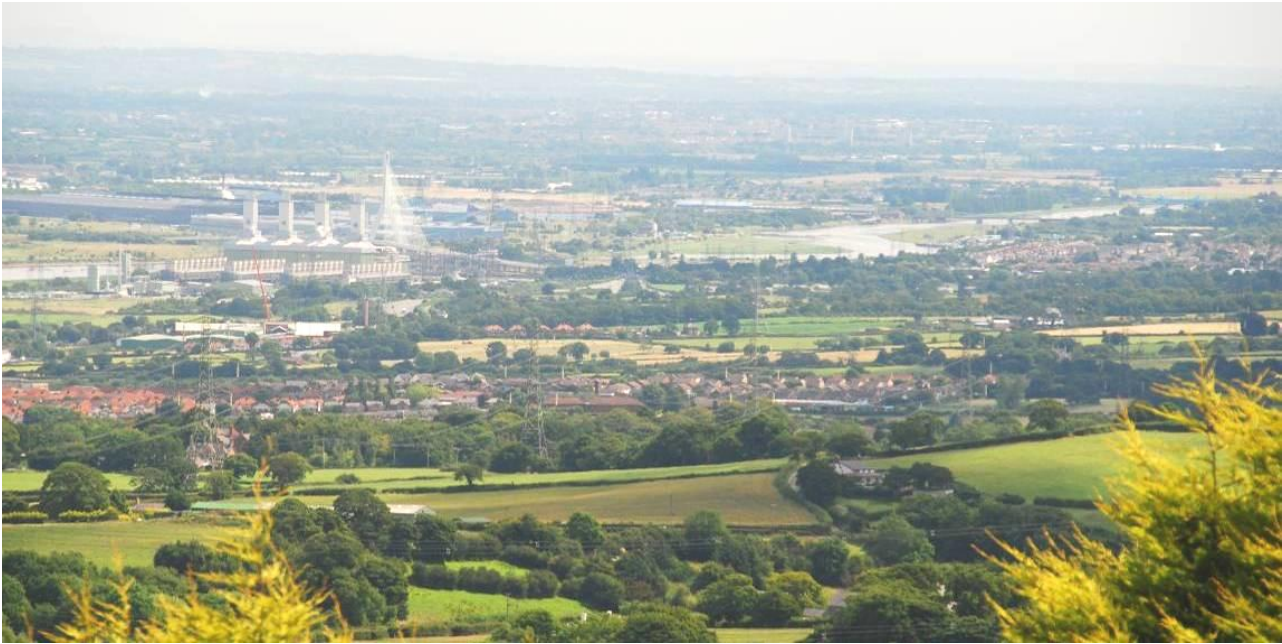
Greater Deeside, with its combination of industry, agriculture and settlement overlooking, the upper Dee Estuary and the Cheshire Plain beyond.