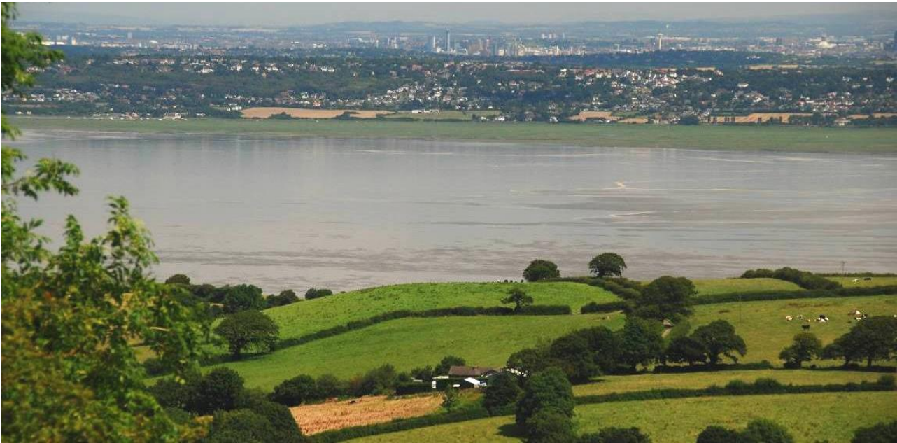
The Dee Estuary, looking across to the Wirral, with greater Merseyside beyond.