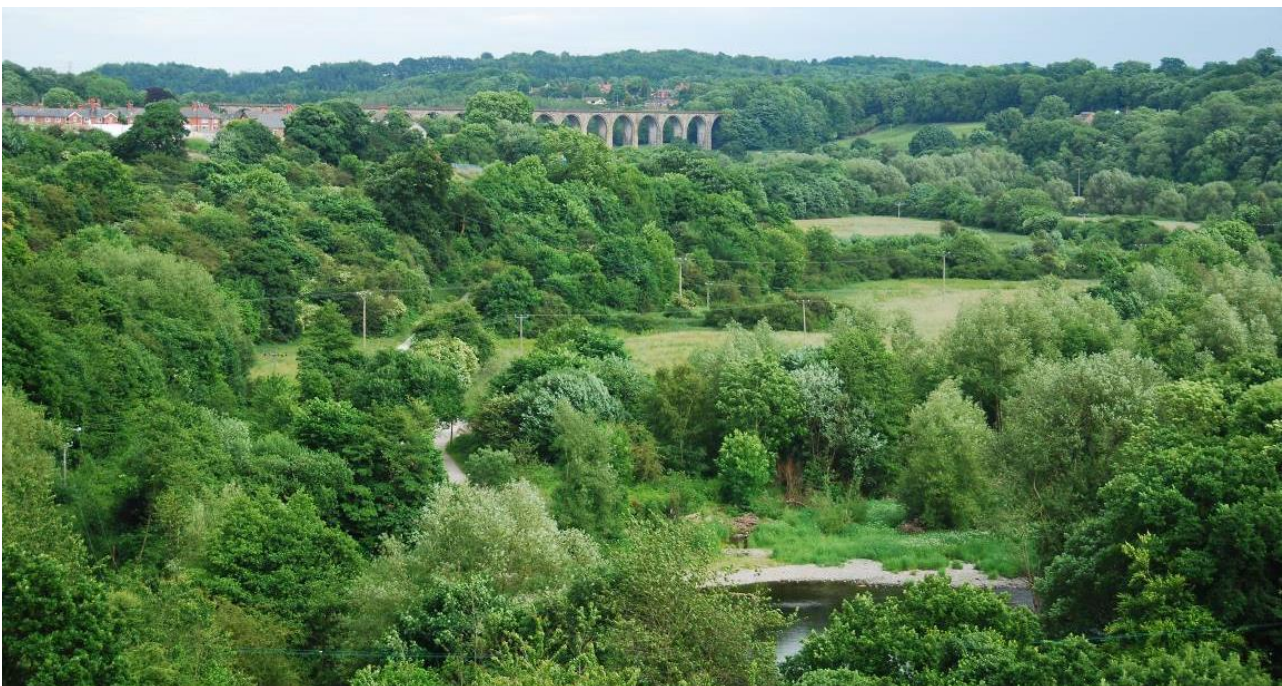
The lower Dee valley. Pont Cysyllte with the Cefn railway viaduct in the distance.