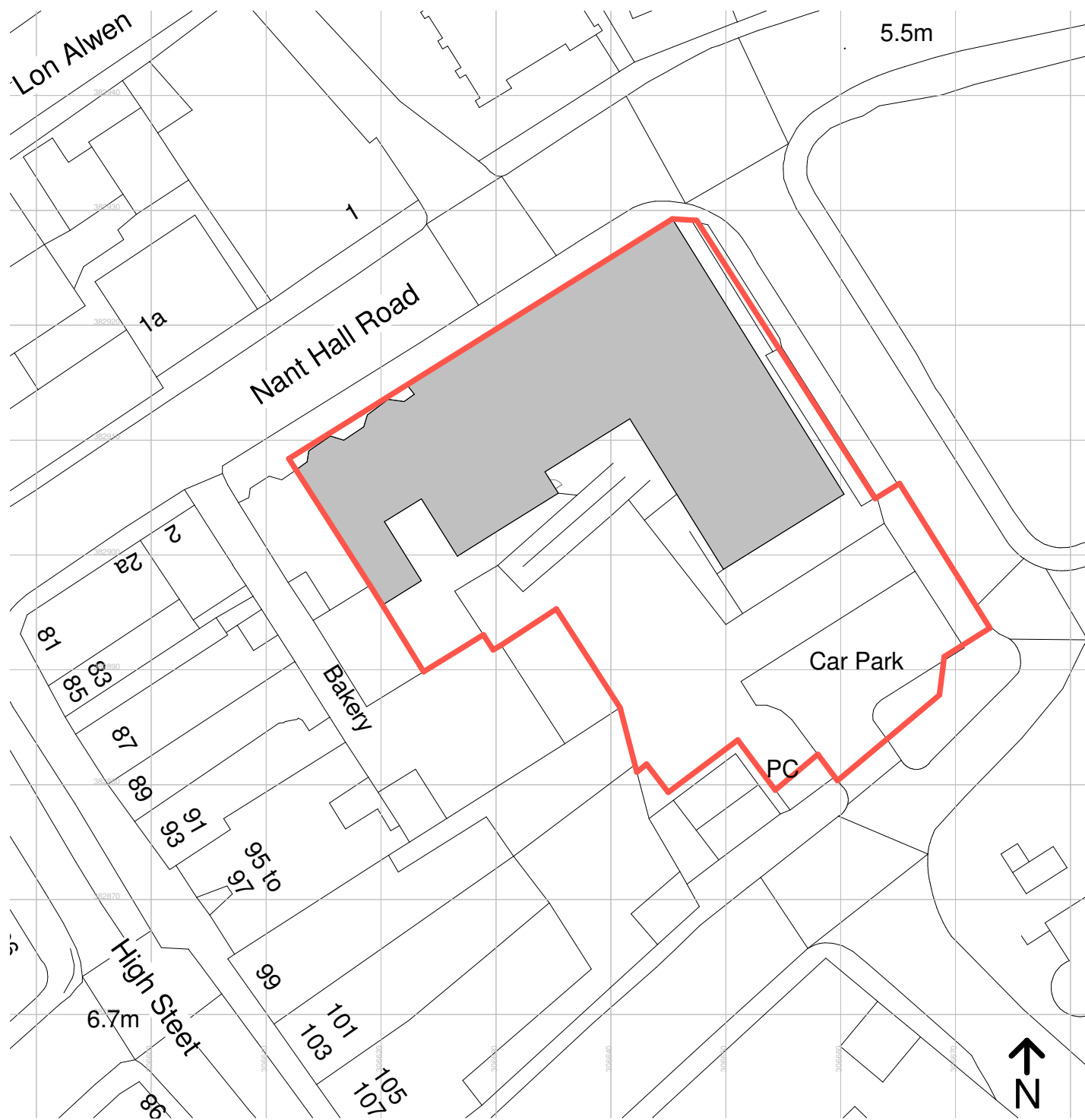
1 Location Plan 1 : 500

Ordnance Survey, (c) Crown Copyright 2024. All rights reserved. Licence Number 100022432