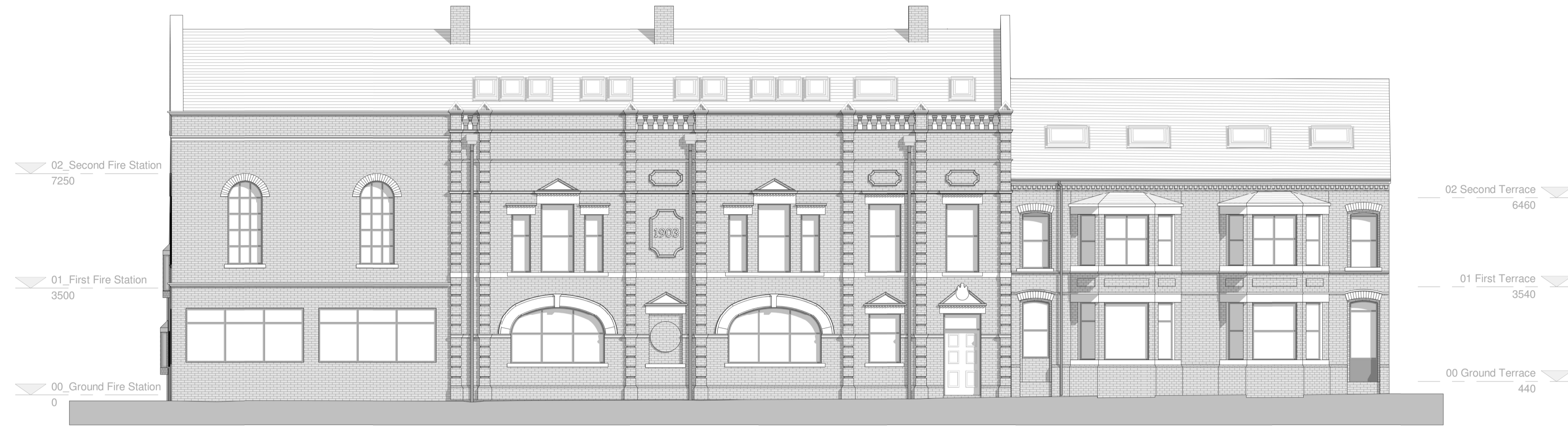
1 00Front Elevation (NW)_Existing 1:100