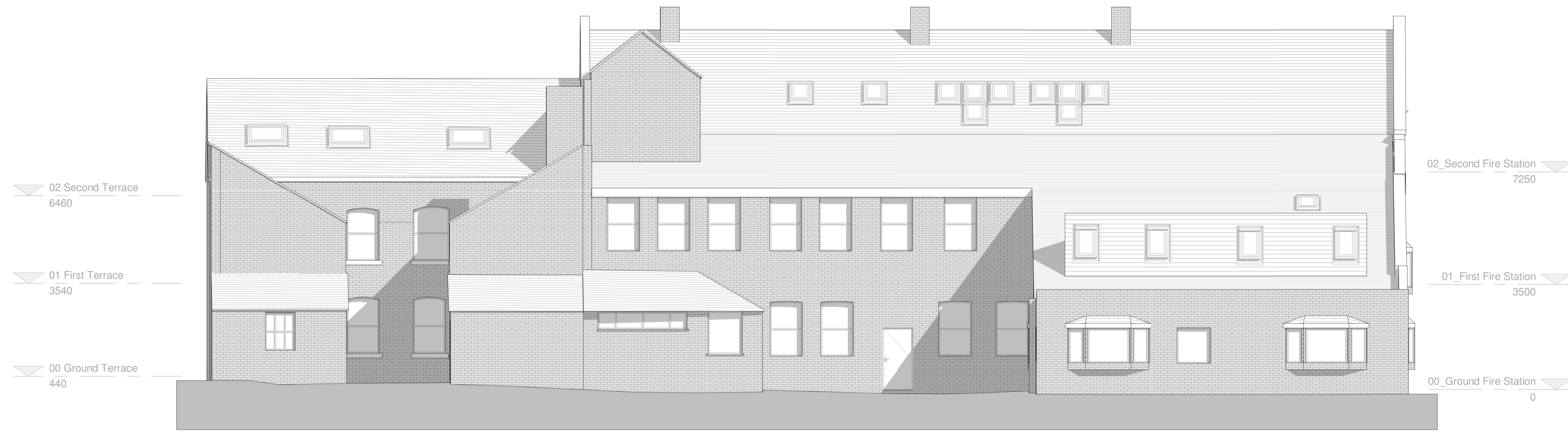
1 00Rear Elevation (NE)_Existing 1 : 100