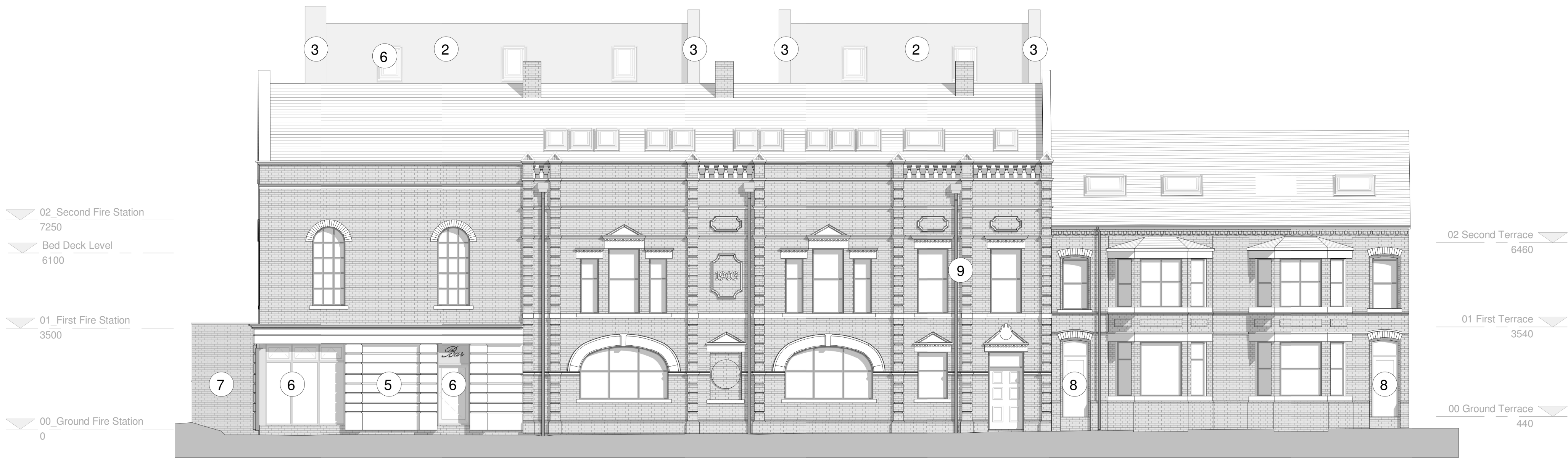
1 00Front Elevation (NW)_Proposed 1 : 100