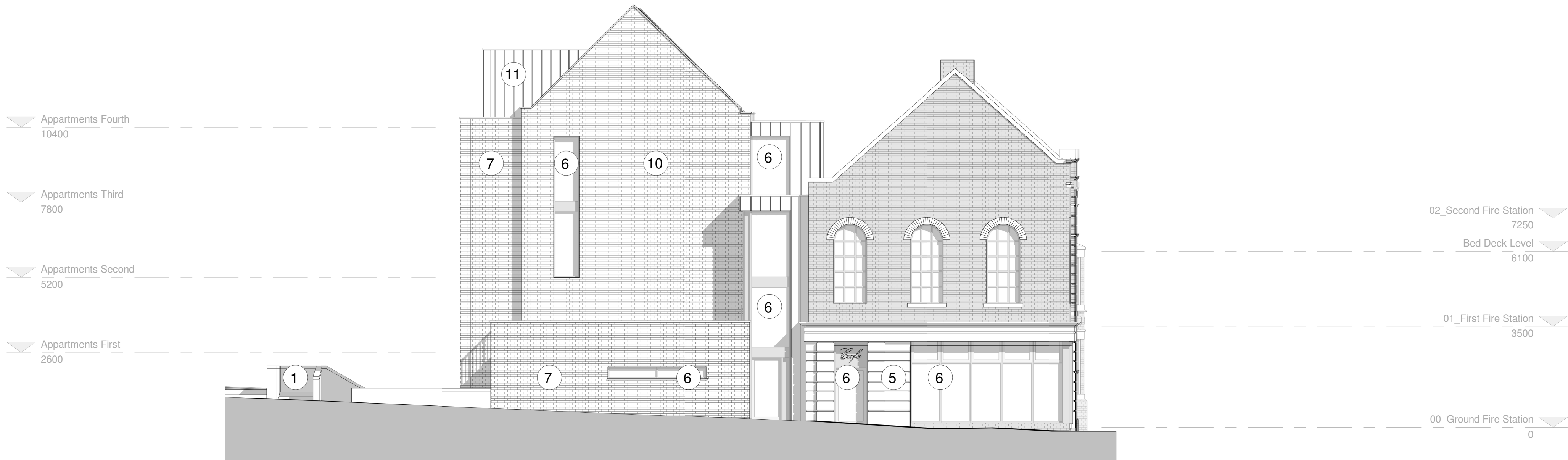
3 00Side Elevation (NE)_Proposed 1 : 100