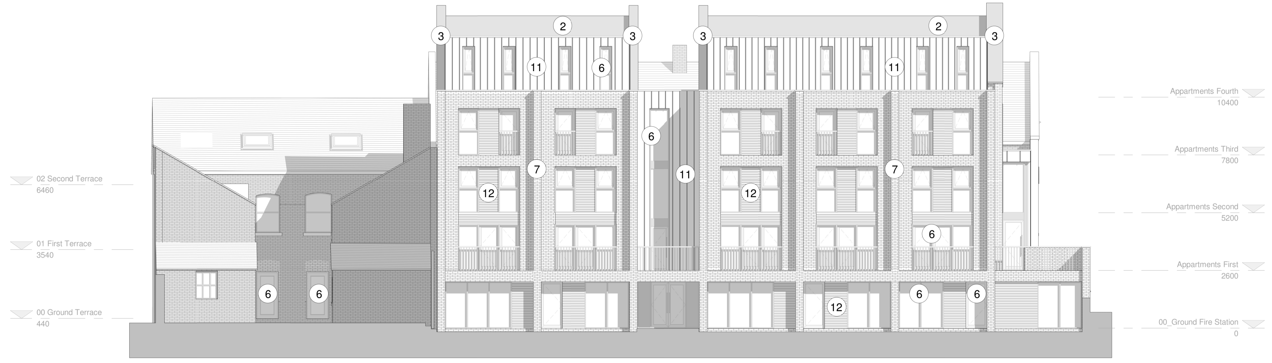
1 00Rear Elevation (NE)_Proposed 1 : 100