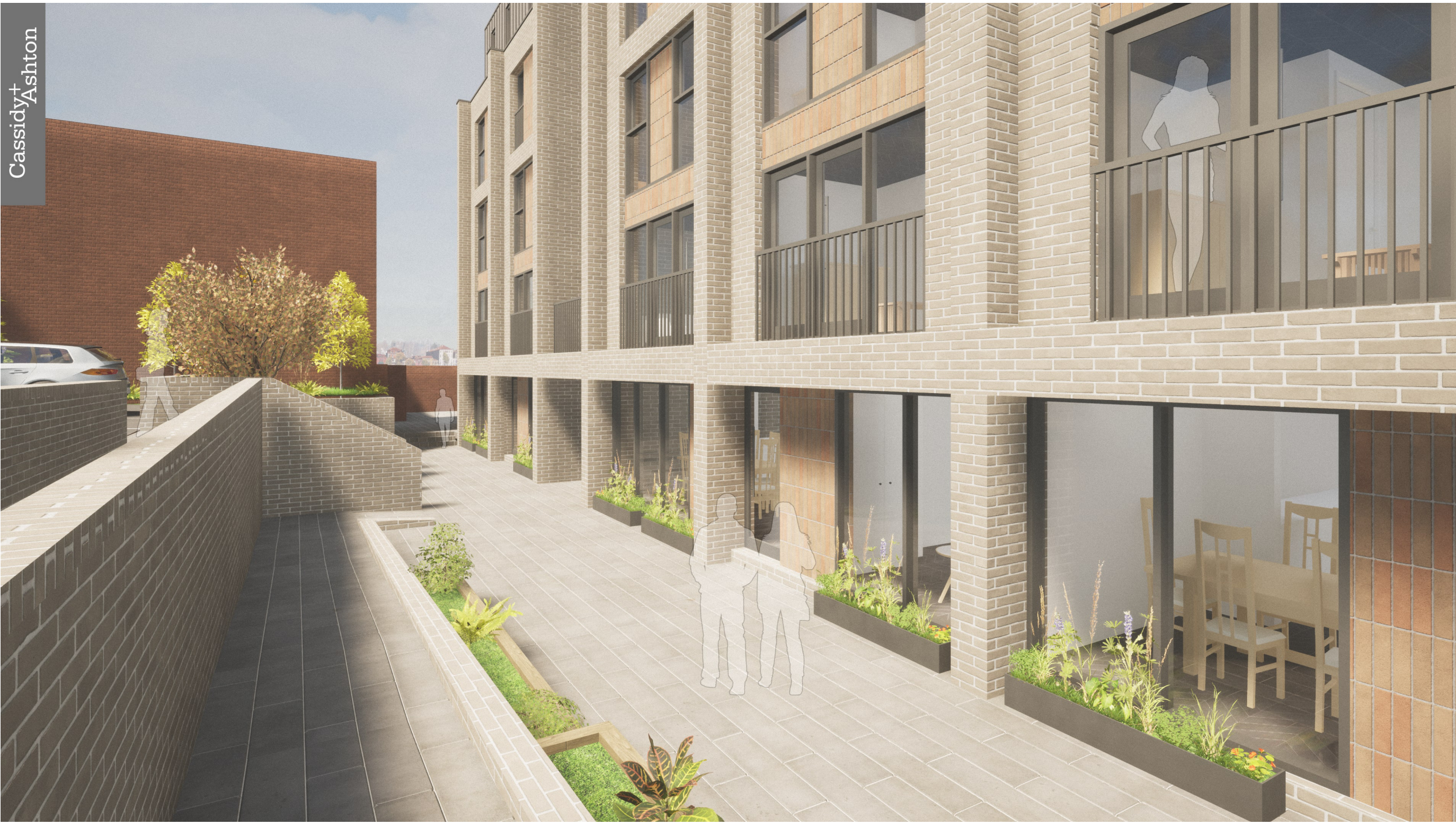
3D Visual 3 - Proposed Landscaping