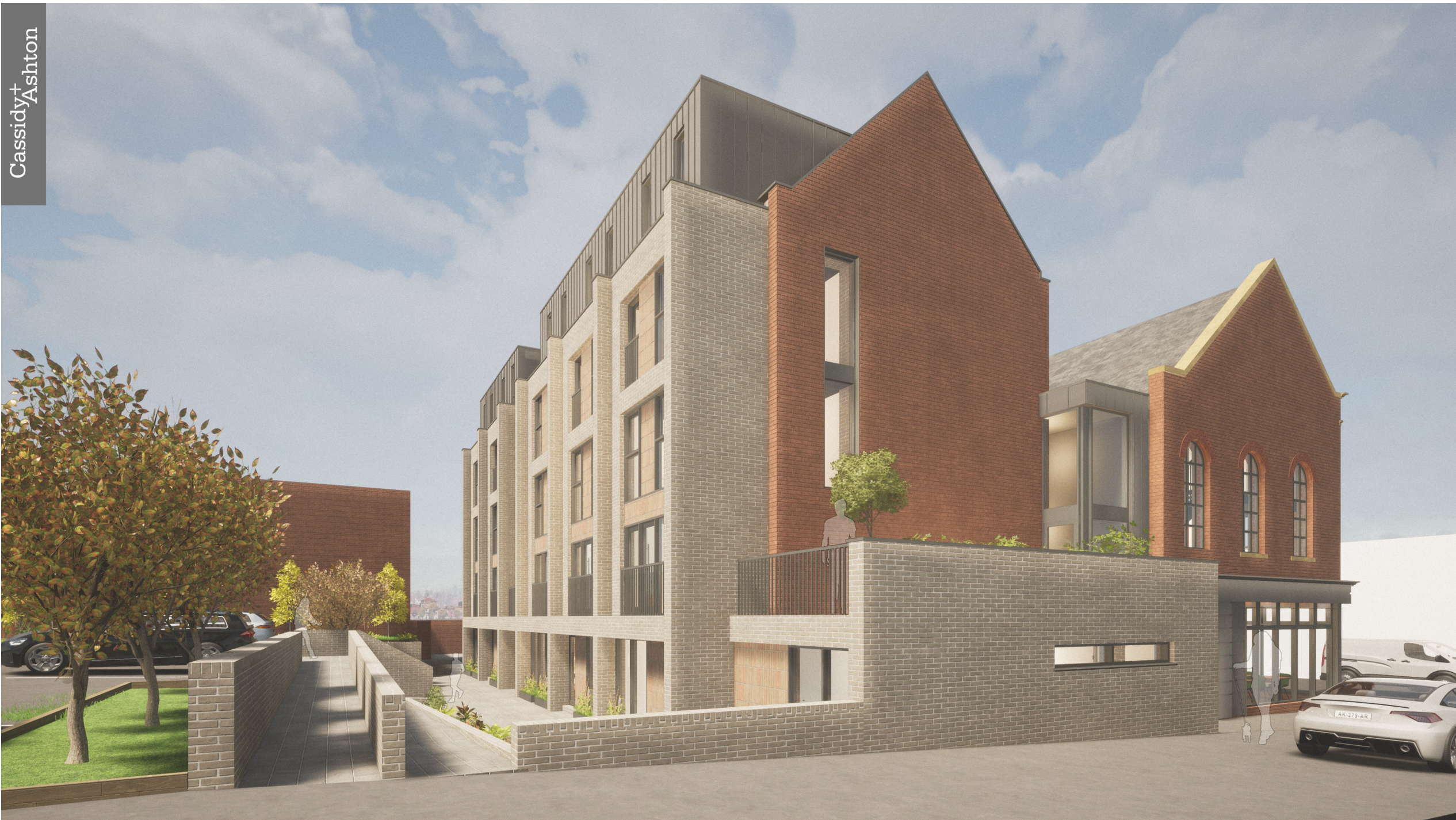
3D Visual 2 - Proposed North East Elevation from the Rear