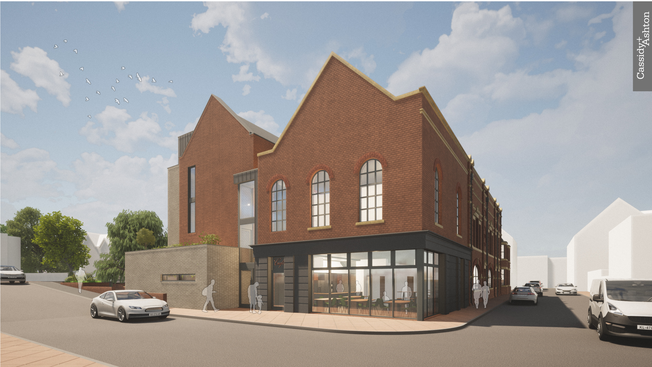
3D Visual 1 - Proposed North East Elevation from Nant Hall Road