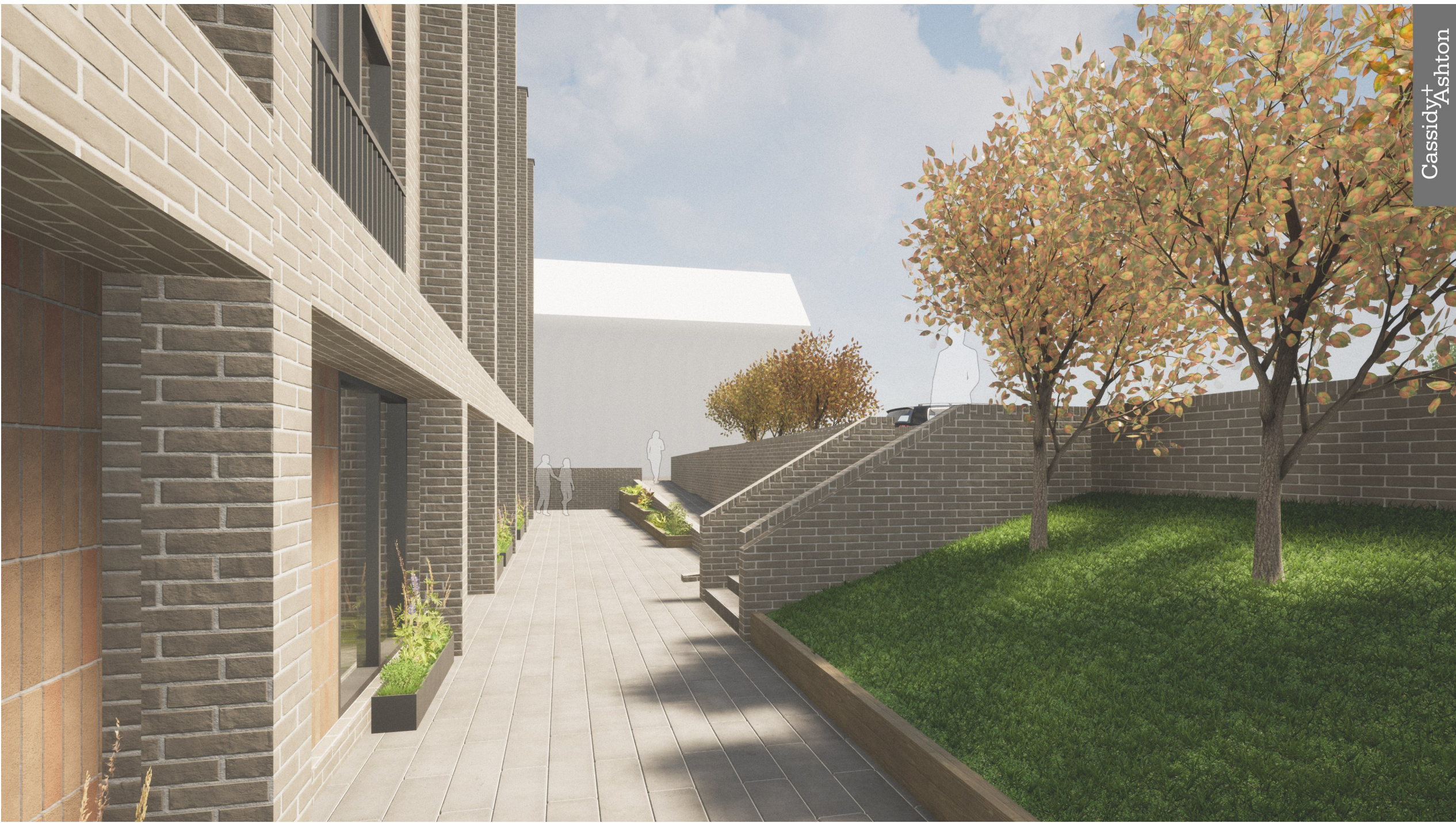
3D Visual 4 - Proposed Landscaping