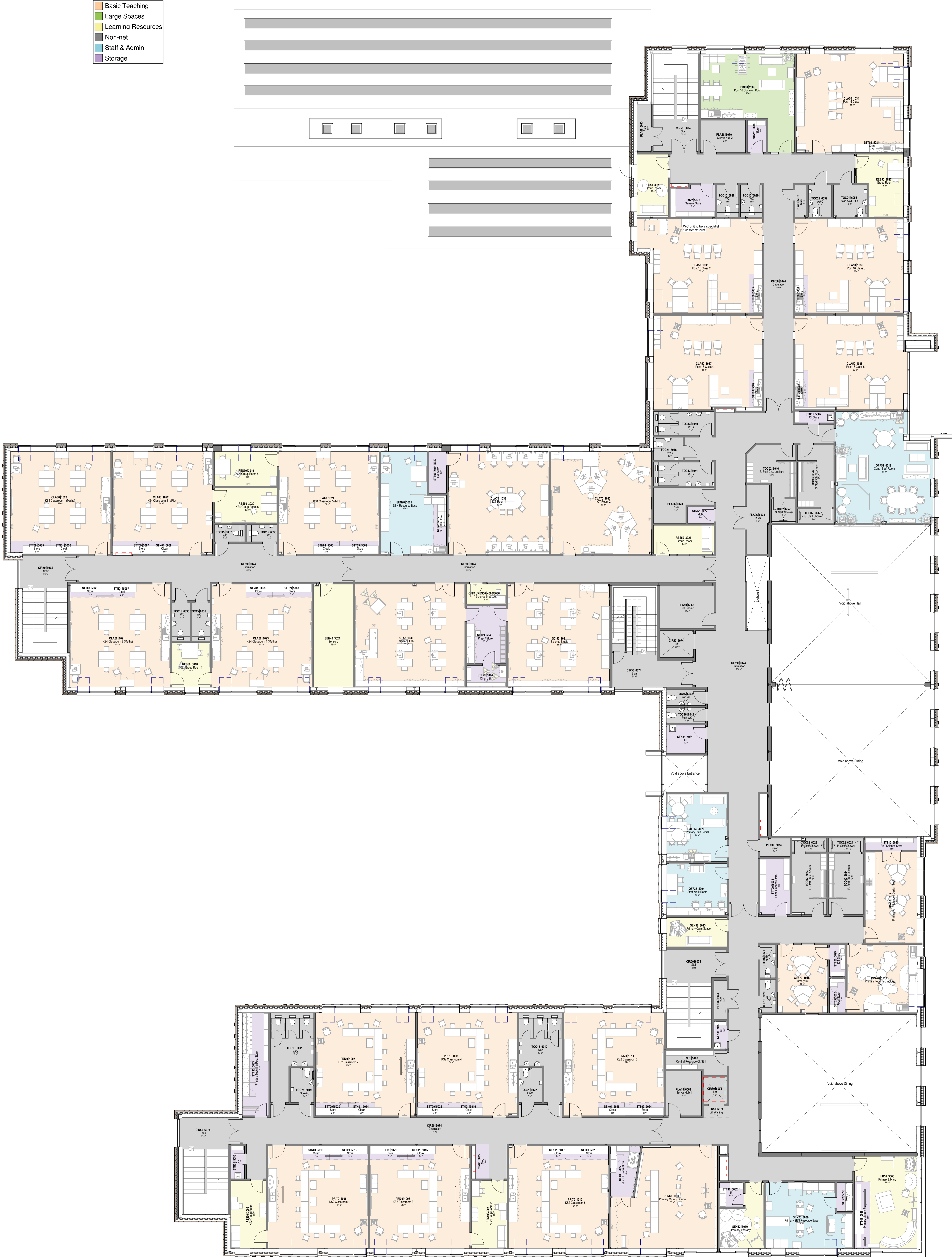
00 - First Floor 1 : 100