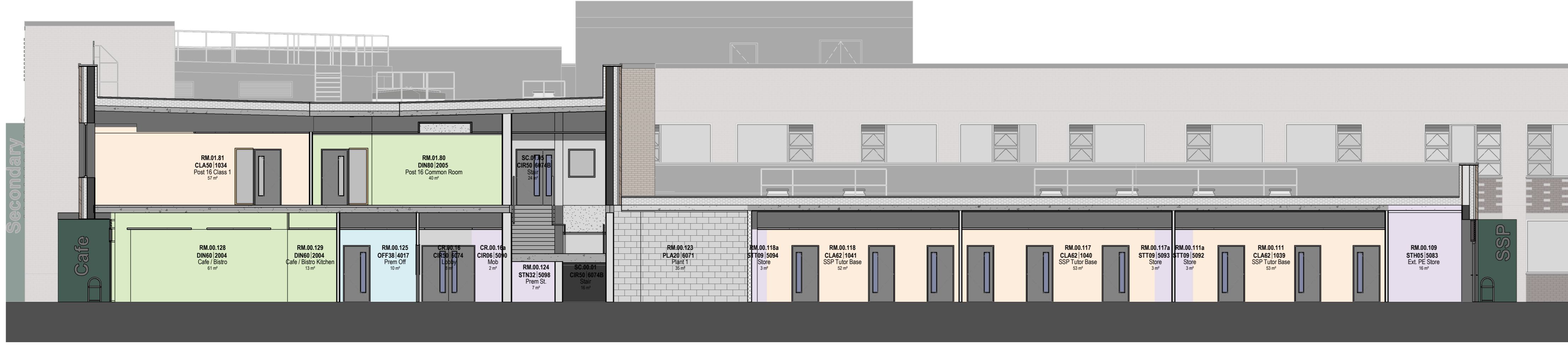
Section 2 (SSP Wing) 1 : 100