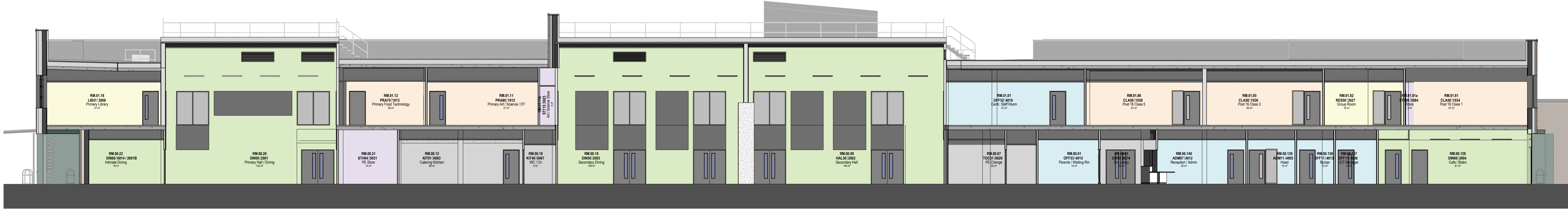
Section 1 (North - South) 1 : 100