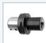
Boring Bar Holders