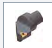
Turning Tools & Boring Bars