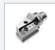
Turning Tool Holders