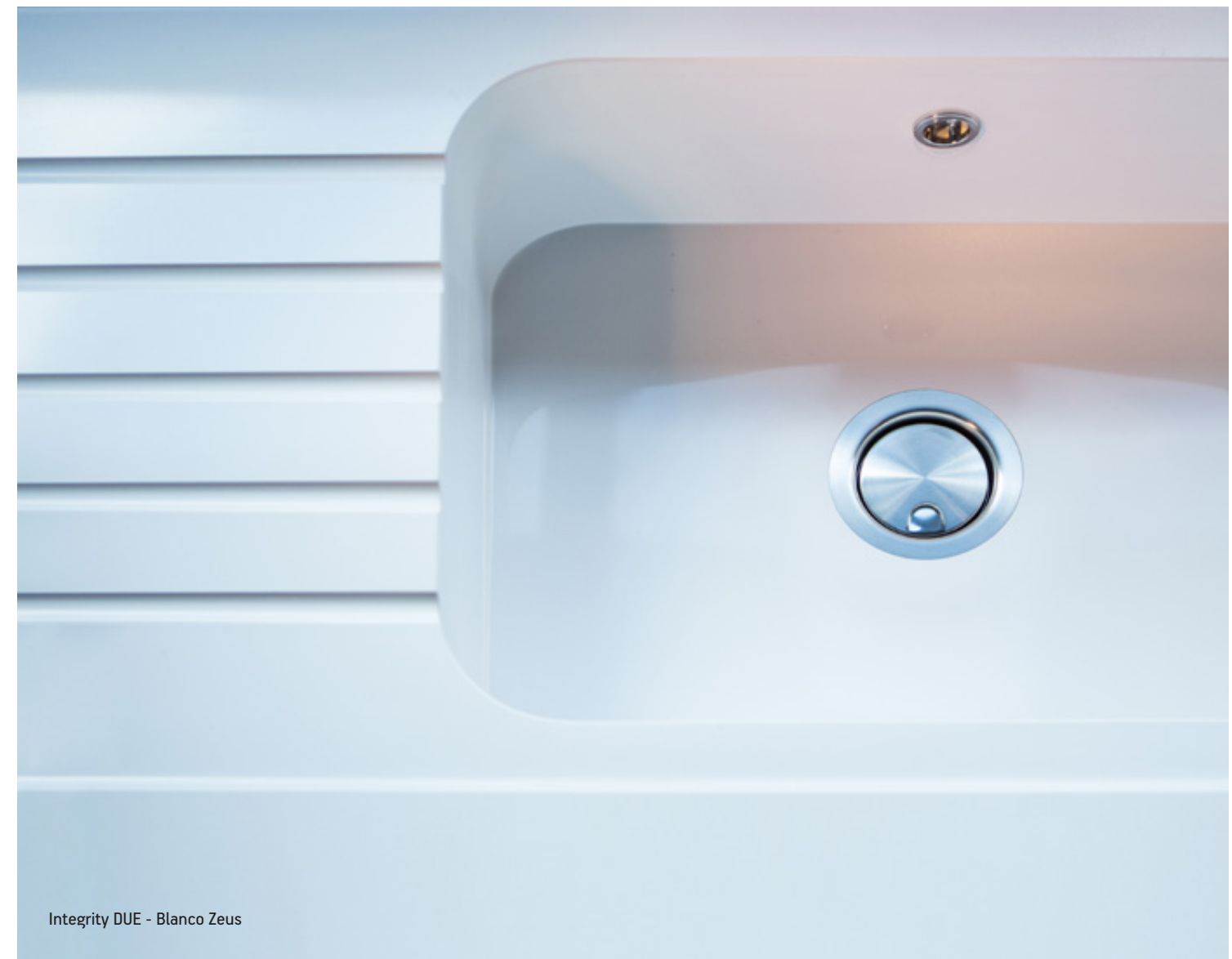
Integrity DUE - Blanco Zeus