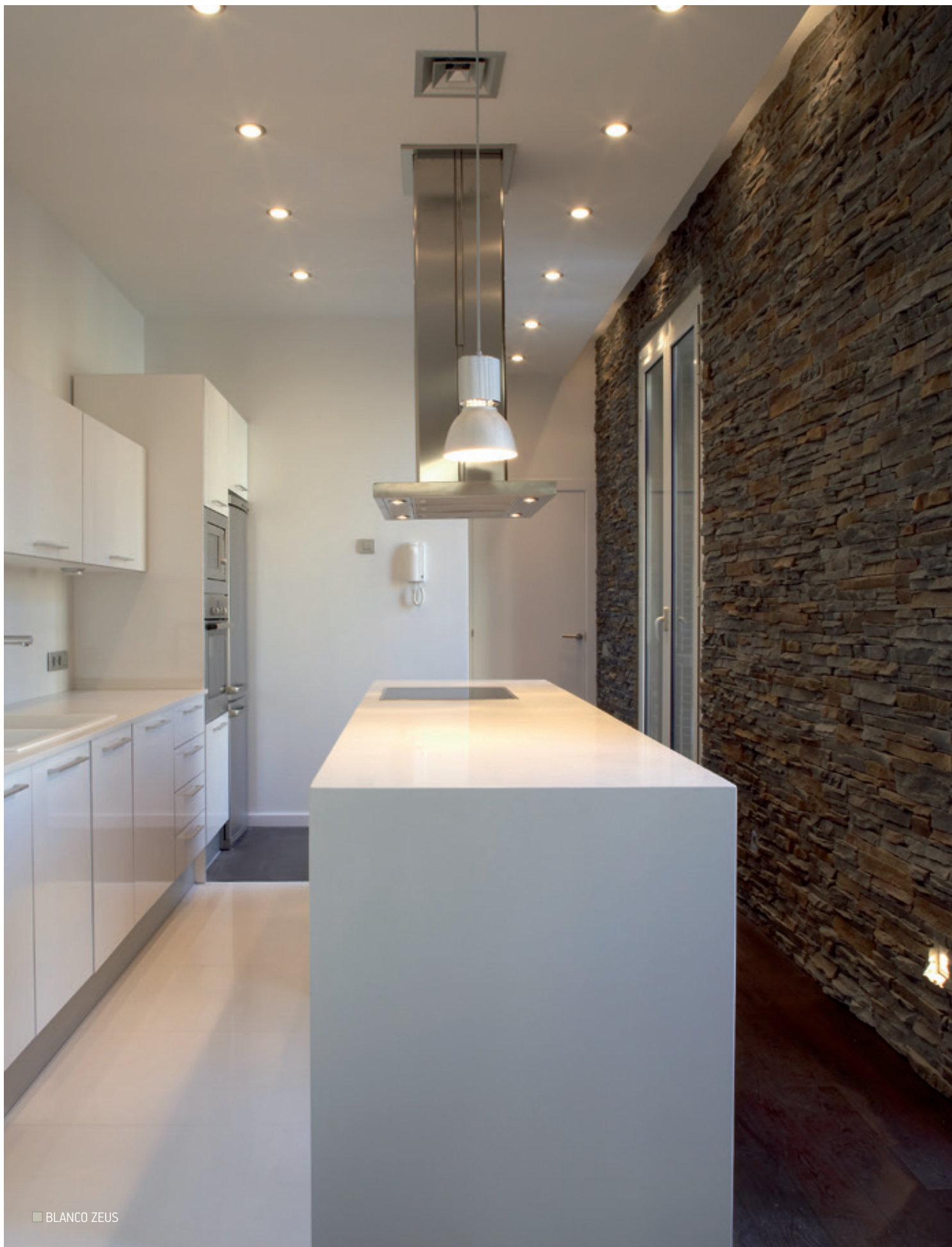
■ BLANCO ZEUS