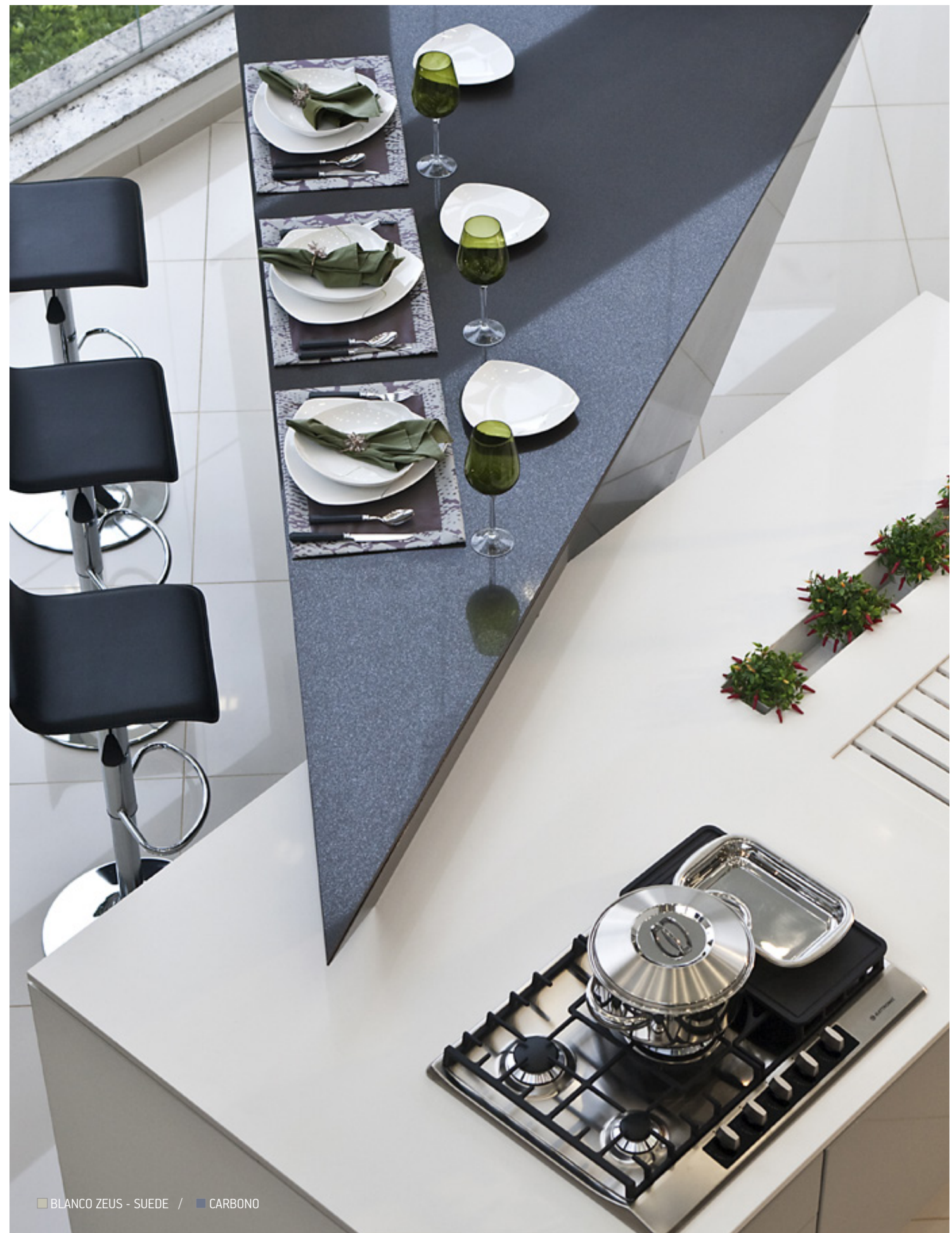
■ BLANCO ZEUS - SUEDE / ■ CARBONO